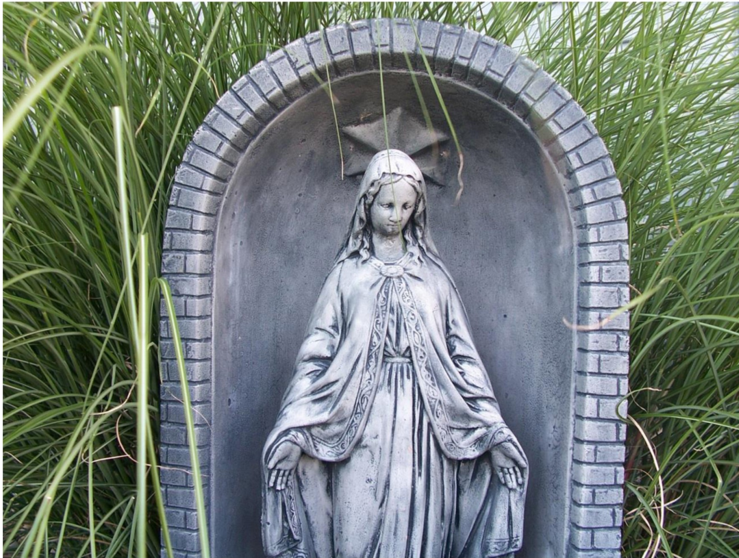
Our Lady Star of the Sea